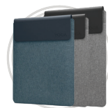
Lenovo Yoga Sleeve (14.5" and 16")

* Example of Lenovo catalogue naming convention