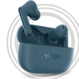
Lenovo Yoga True Wireless Stereo Earbuds