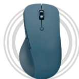
Lenovo Yoga Pro Mouse