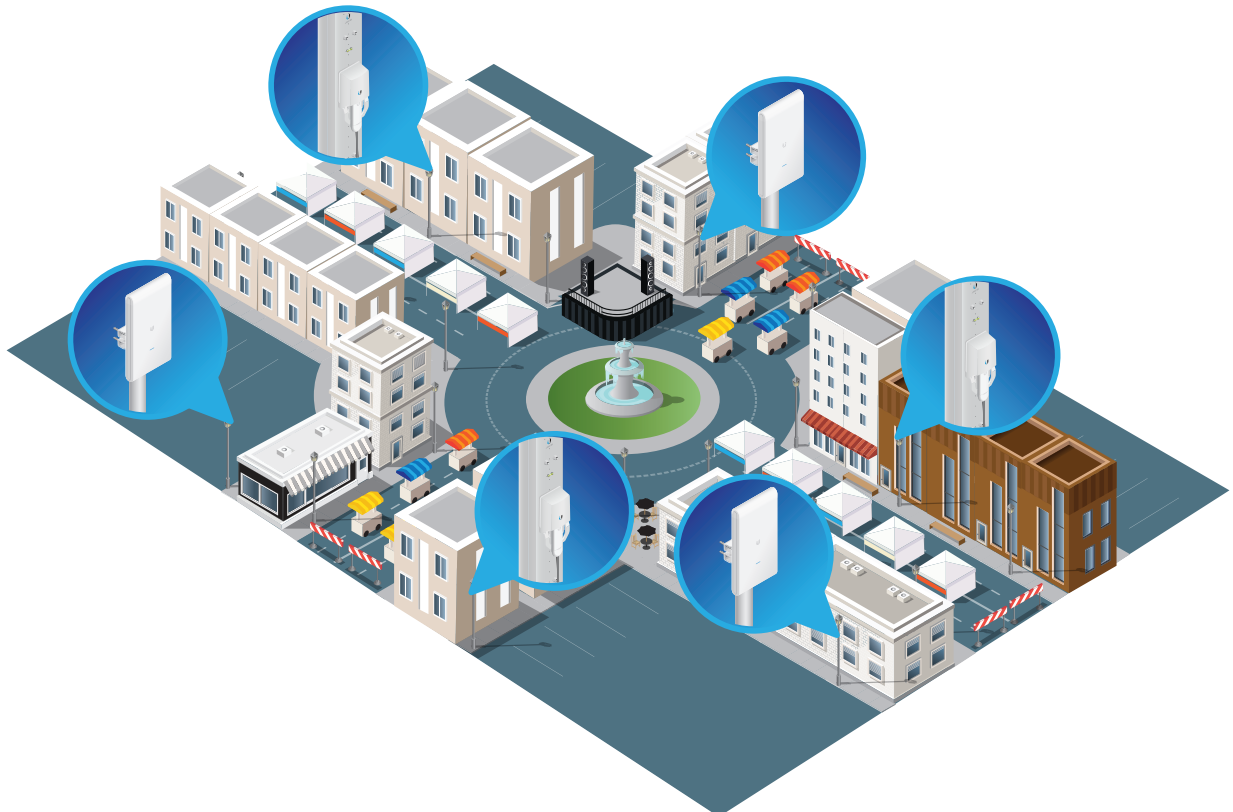
Both UniFi AC Mesh models provide wireless coverage for a street fair in a city plaza.