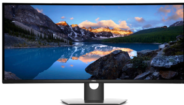
DELL ULTRASHARP 38 CURVED MONITOR | U3818DW

Enjoy expansive views, incredible visuals and improved multitasking with this 38-inch curved monitor with an InfinityEdge display.