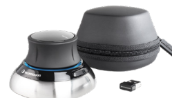
3DCONNEXION SPACEMOUSE WIRELESS

Enjoy expansive views, incredible visuals and improved multitasking with this 38-inch curved monitor with an InfinityEdge display.