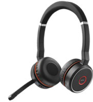
JABRA EVOLVE 75

Designed specifically for Dell, the Timbuk2-Authority backpack is built to carry and protect everything you need for the workday. The internal organizer provides ample space for laptop accessories and any extra items you need to carry.