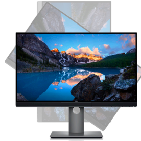
DELL ULTRASHARP 4K USB-C MONITOR WITH PREMIER COLOR | UP2720Q

Dell's most powerful dock* for our most powerful workstations* delivers the ultimate productivity experience. Charge your system faster, support up to three 4K displays and connect to your peripherals via a single cable with dual USB-C connectors for up to 240W of power delivery.