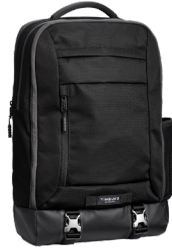
TIMBUK2 - AUTHORITY FOR DELL - 15"

Connect your Precision to almost any device with a convenient 6-in-1 compact adapter, to collaborate from any location.